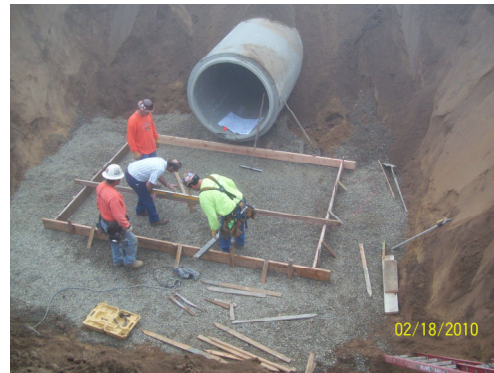
A crew from Clyde Wheeler Pipeline forms the floor for a box on the Lateral R in Manteca, a pipeline replacement project north of Louise Ave. between Austin and Prescott Roads.

SSJID would like to thank its Engineering staff, Manteca's MCR Engineering, Inc., District crews and our contractors for the outstanding jobs they did at completing projects on time and within budget! Contractors included Knife River Construction, Rolfe Construction, Allen A. Waggoner Construction, Johnson Western Gunitite and Clyde Wheeler Pipeline, Inc.