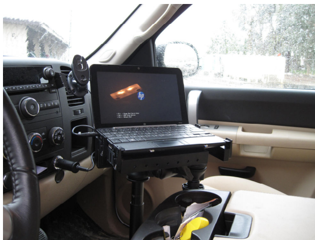
Shown above is an example of the wireless HP notebooks that are now mounted in District trucks. The notebooks run SSJID's new TruePoint software, an investment made to improve record keeping for both the Water Operations Department and our growers.

effect, and Shields' hope is that True Point will give us the quality of data that will allow us to protect our water rights—records that allow us to defend, before a judge, how we account for our water.